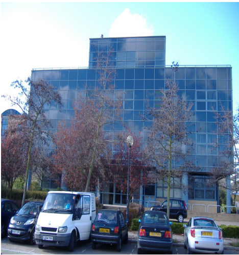
Blackfriars House, 379 South Row, Milton Keynes

Location: The property is situated in an established central location in the heart of Milton Keynes. Milton Keynes is situated 55 miles north of London and 70 miles south of Birmingham, adjacent to the M1 motorway.